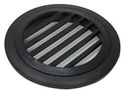
Black PVC Grill