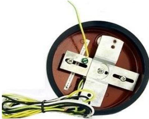
Heavy Duty Cross Mounting Yoke