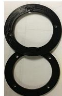
Shade Gasket & Washer