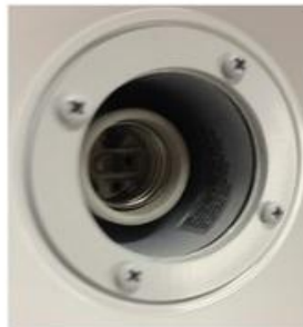
Exclusive Recessed Socket Design