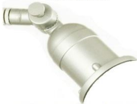
Exclusive Cast Swivel & Head Piece