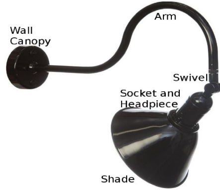
ADLXSV930 Figure A